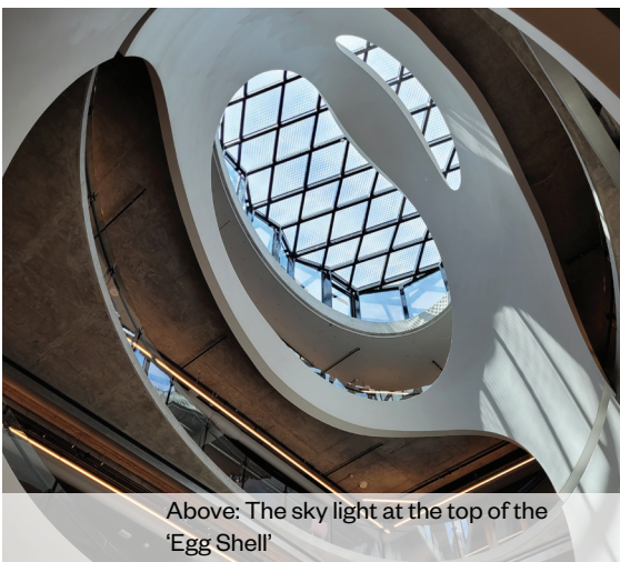
Above: The sky light at the top of the 'Egg Shell'