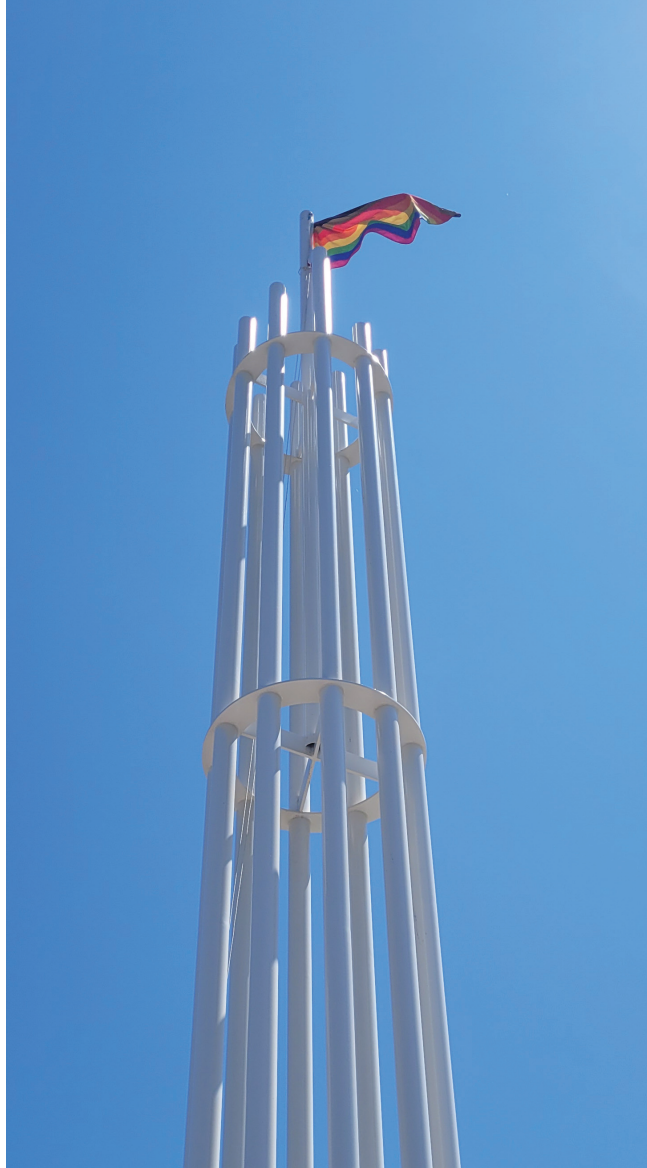
Above: Our Tribute Flagpole commenced flying the Rainbow flag – more flags to come! Thank you to the nine community individuals who funded the flagpole.