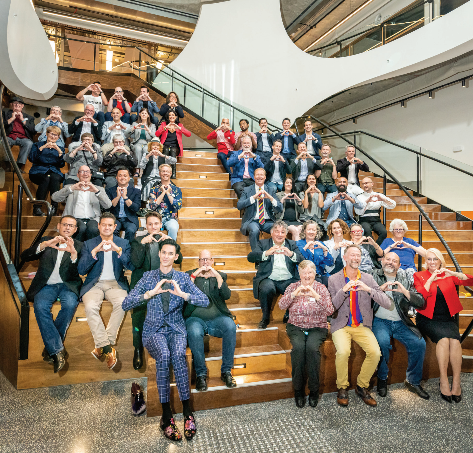
Above: Founders and Fundraising Working Group members at the March 2021 Founders' Circle event

Our supporters are celebrated and profiled on our social media platforms, providing us an opportunity to hear what LGBTIQ+ communities feel about our new home.