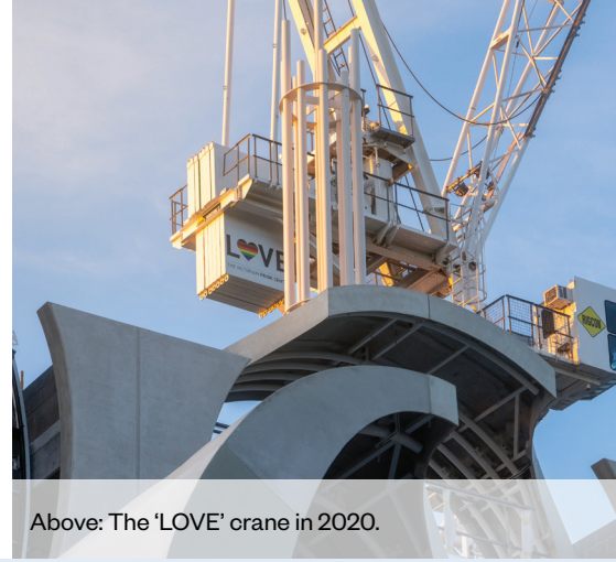
Above: The 'LOVE' crane in 2020.

The 18m tall glass reinforced concrete structure was procured from Malaysia and contains 34 panels suspended from various slab edges.