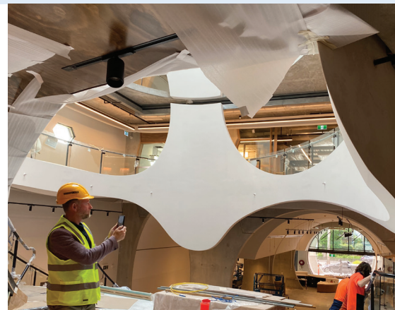
Above: Construction nearing completion in the Pride Centre's 'Egg Shell' atrium.

The compactus was installed on mezzanine level – the compactus is an integral piece of the fit out for the Australian Queer Archives.